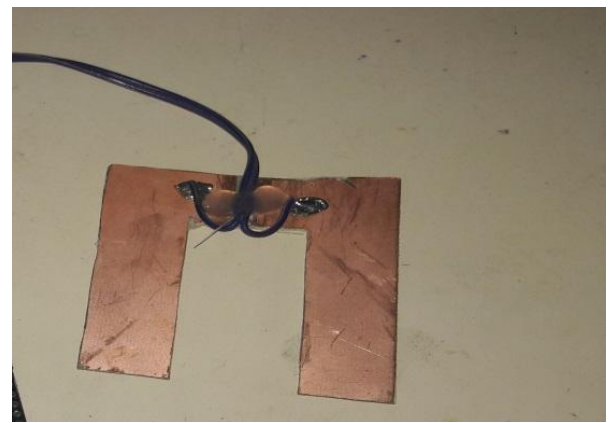
Fig. 1: Photograph of a Soil Moisture Sensor

Probes: A designed resistive sensor is used to sense the moisture content in the soil. It works on the principal of electrical conductivity. Resistance of the sensor is inversely proportional to moisture content in the soil. Moisture content of the soil is a major factor determining plant growth. The present work Comprises of development of a soil moisture sensor. Figure 1 shows the Photograph of a Soil Moisture Sensor.