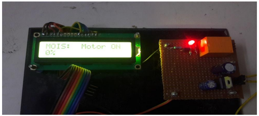
Fig.7: Moisture at 0%