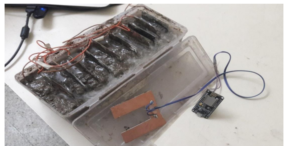
Fig.2: Overview of Transmitter Circuit