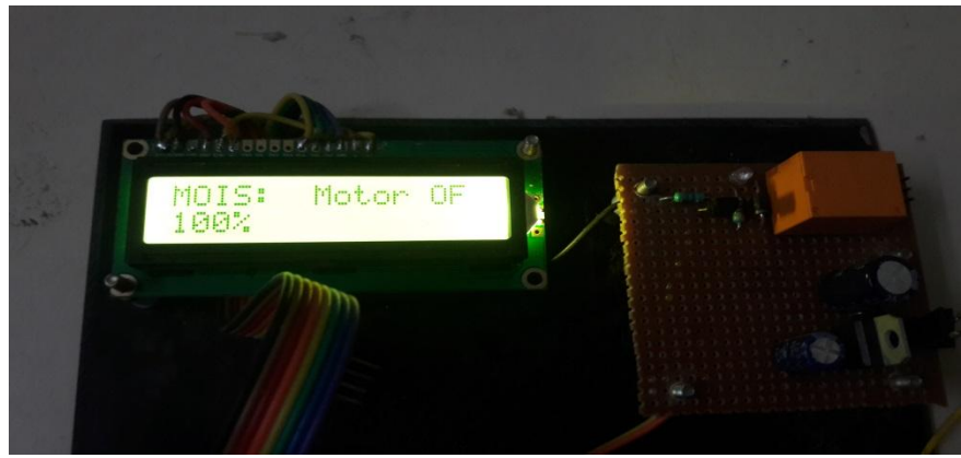
Fig.8: Moisture at 100%